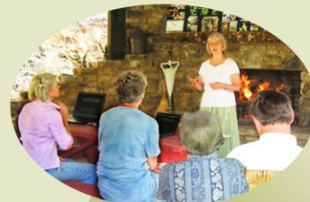
Assistance to property owner associations and other groups to plan large hemlock treatment projects, training for their volunteers, and Facilitators to lead the work teams.