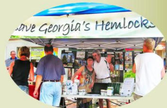
Participation in local fairs and festivals to raise awareness, provide useful printed information, and offer healthy hemlock saplings for adoption.