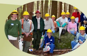
Hemlock treatment projects by Facilitators and other volunteers to support the US Forest Service, Georgia Department of Natural Resources, municipal departments, nonprofits, and property owners