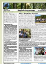
Quarterly newsletters for members, donors, and friends to share new developments, progress, tips, and upcoming or completed events.