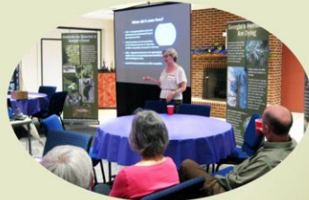
Hemlock Help Clinics and presentations to community groups to raise awareness of the hemlock problem and current solutions.