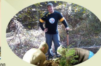
Hemlock growing and planting projects for reforestation of healthy trees on public lands.