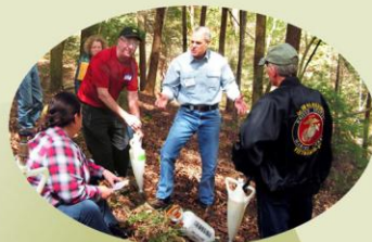
Facilitator training to prepare volunteers to advise and assist others in their community and to lead hemlock treatment projects. Facilitators have been trained in GA, TN, AL, and NC