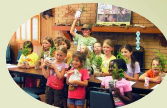
Hemlock Lessons with seedling potting for school groups and camps to engage the next generation and share the hemlock message with their families.