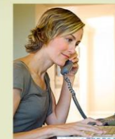
Hemlock Help Line serving the entire US to answer questions, explain treatment options, and coordinate Facilitator on-site visits.