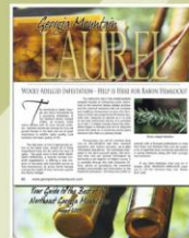
Articles published in newspapers, magazines, and organization newsletters to disseminate practical information and promote timely action.