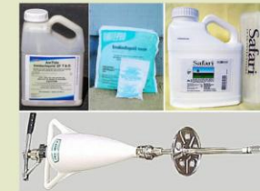
HWA treatment product information for property owners - use instructions, sources for borrowing and purchasing.