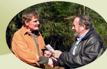
Free on-site Facilitator visits to property owners to assess HWA infestations, explain treatment options, and help property owners get started.