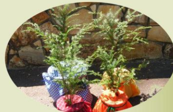
Healthy hemlock saplings available for adoption by individuals and hemlock seedlings for donation to schools, churches, and nonprofits.