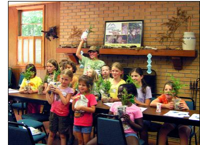
$100 = Educational event for 100 school children