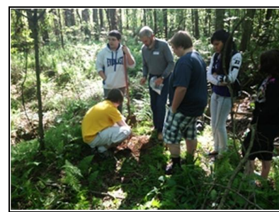
$100 = Planting 20 small hemlock saplings at a school