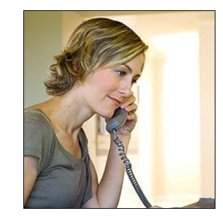
$100 = Cost of Hemlock Help Line for one month