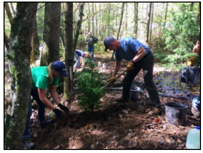
$100 = Planting 6 large hemlock saplings on a trout stream