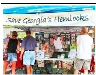
$100 = Educational materials for a local festival