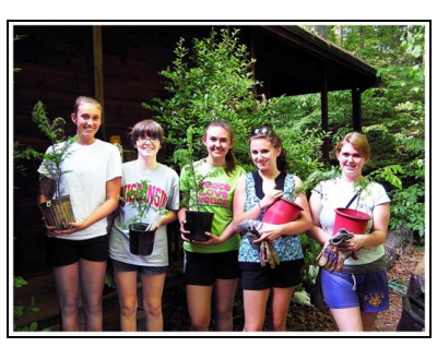
$100 = Rescue, potting & care of 25 small hemlock saplings