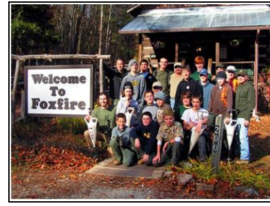
$100 = Support for one Eagle Scout hemlock treatment project