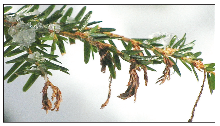
Tip dieback on eastern hemlock infected with Sirococcus tsugae