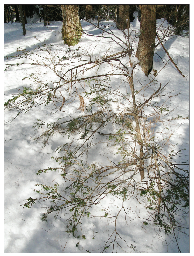
Eastern hemlock regeneration in Maine affected by shoot tip blight

The causal pathogen has been identified as Sirococcus tsugae based on fruiting structures collected in fall 2009 and confirmed by the USDA Animal and Plant Health Inspection Service from morphological characteristics and genetic typing. This was the first report of S. tsugae occurring on eastern hemlock even though this pathogen is known to infect hemlock in the Western United States. It is not known how S. tsugae arrived in eastern forests.