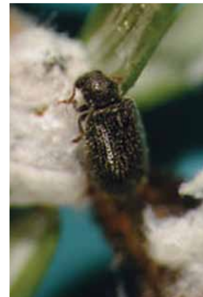
These graceful giants are now under threat of possible extinction over the next decade due to a tiny invasive insect, the hemlock woolly adelgid. Research laboratories in the eastern U.S. are rearing several species of beetles (left) that eat hemlock woolly adelgids to help suppress the intensely invasive insects.