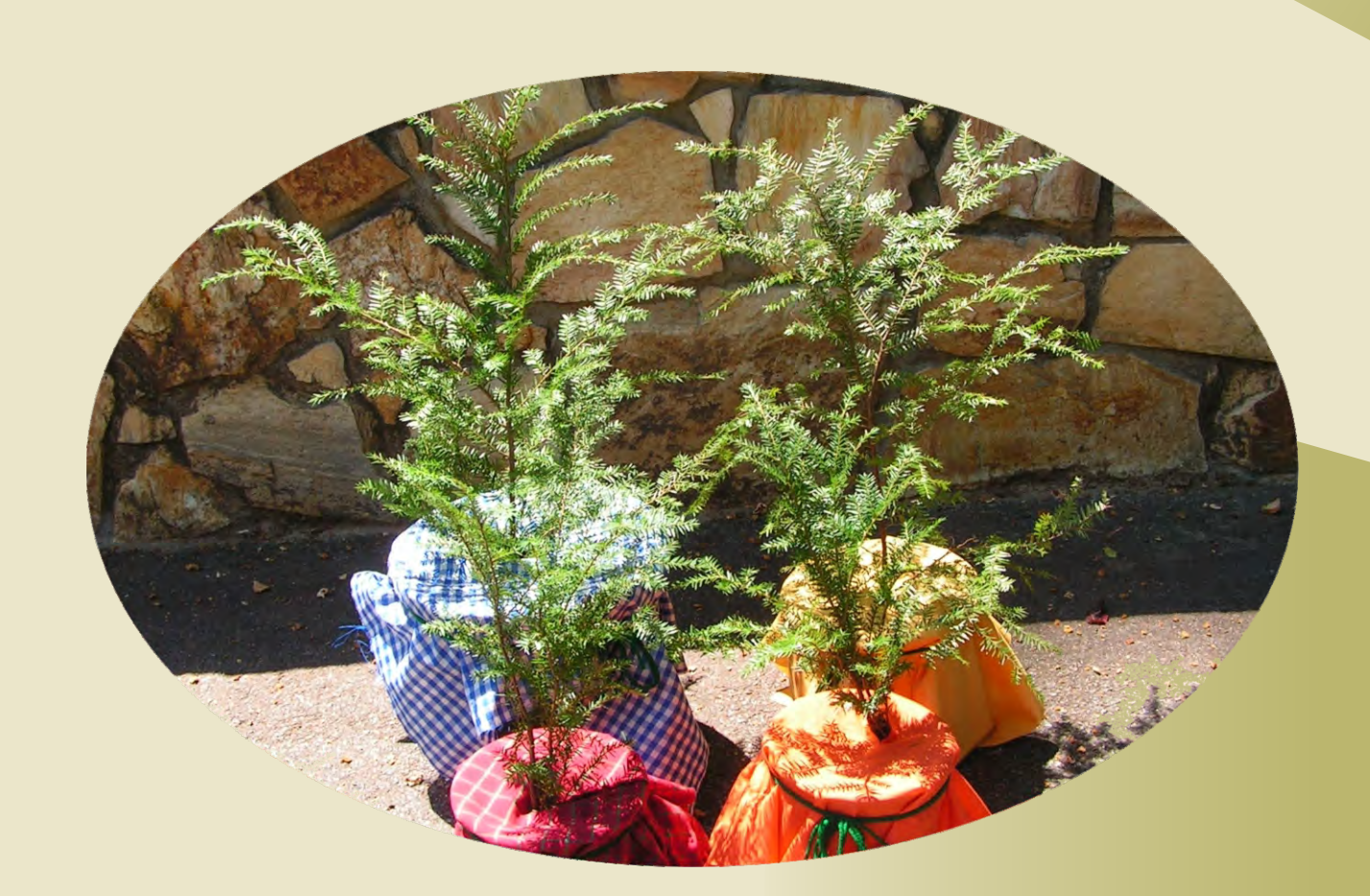
Healthy hemlock saplings available for adoption by individuals and hemlock seedlings for donation to schools, churches, and nonprofits.