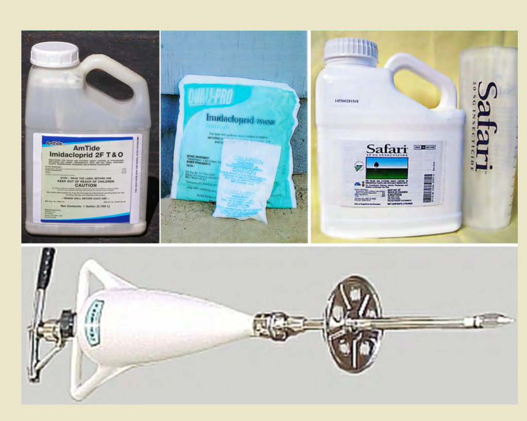
HWA treatment product information for property owners - use instructions, sources for borrowing and purchasing.