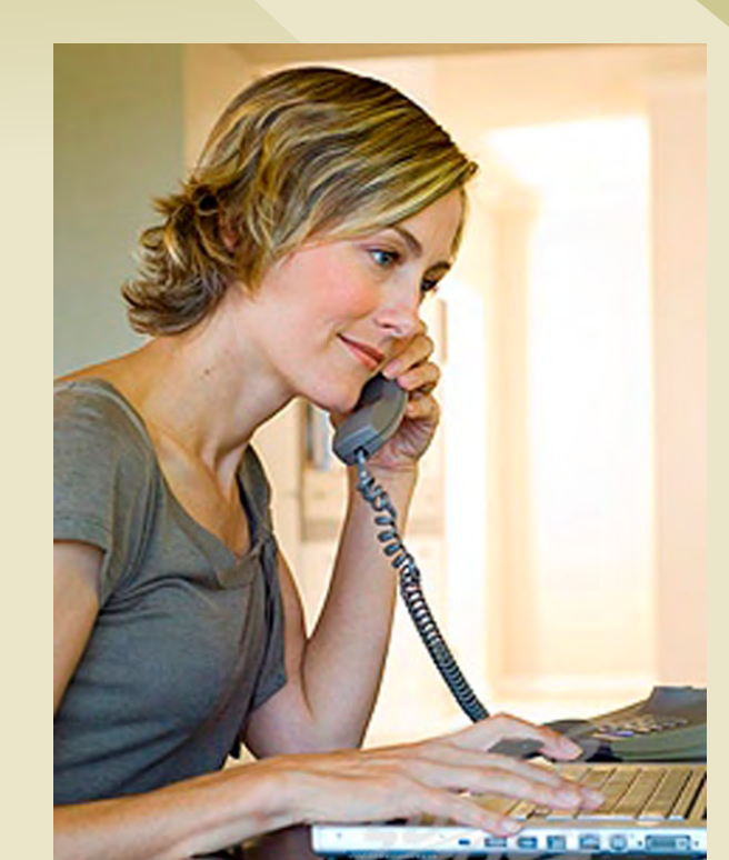
Hemlock Help Line serving the entire US to answer questions, explain treatment options, and coordinate Facilitator on-site visits.