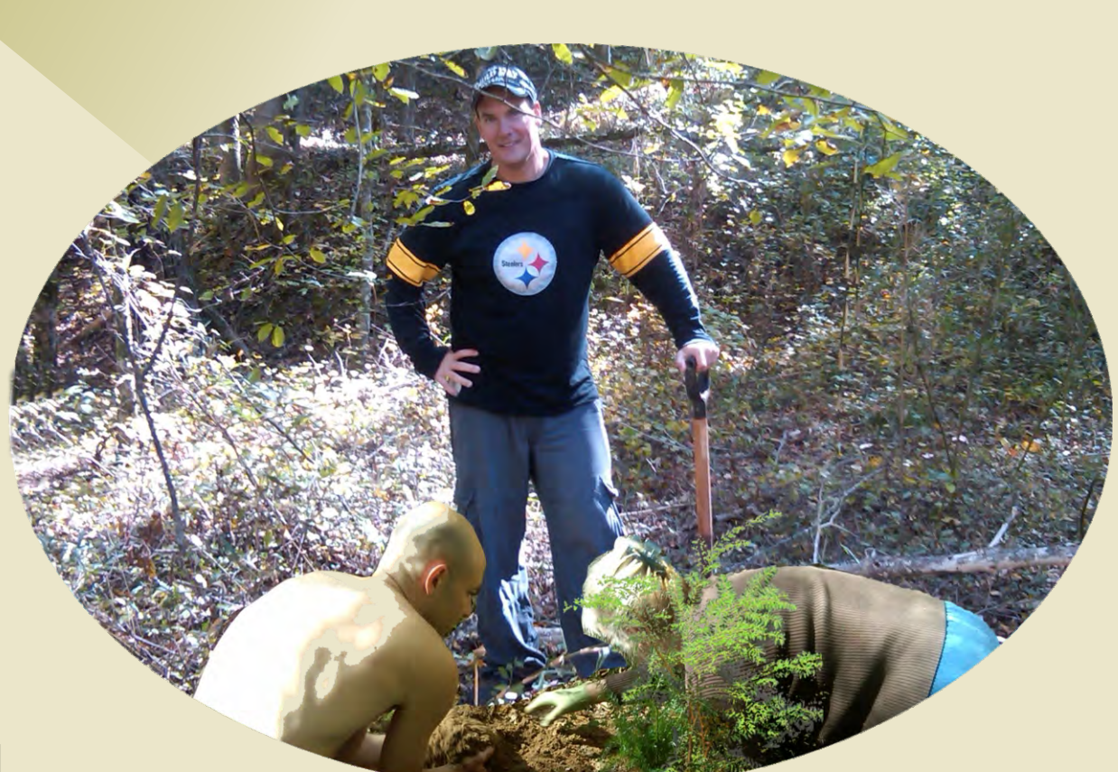
Hemlock growing and planting projects for reforestation of healthy trees on public lands.