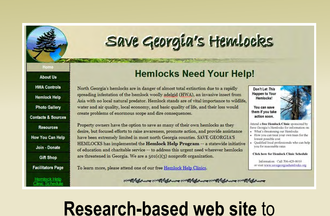
provide accurate up-to-date information on the hemlock problem, controls, sources for treatment products and equipment, qualified professionals, and help available.