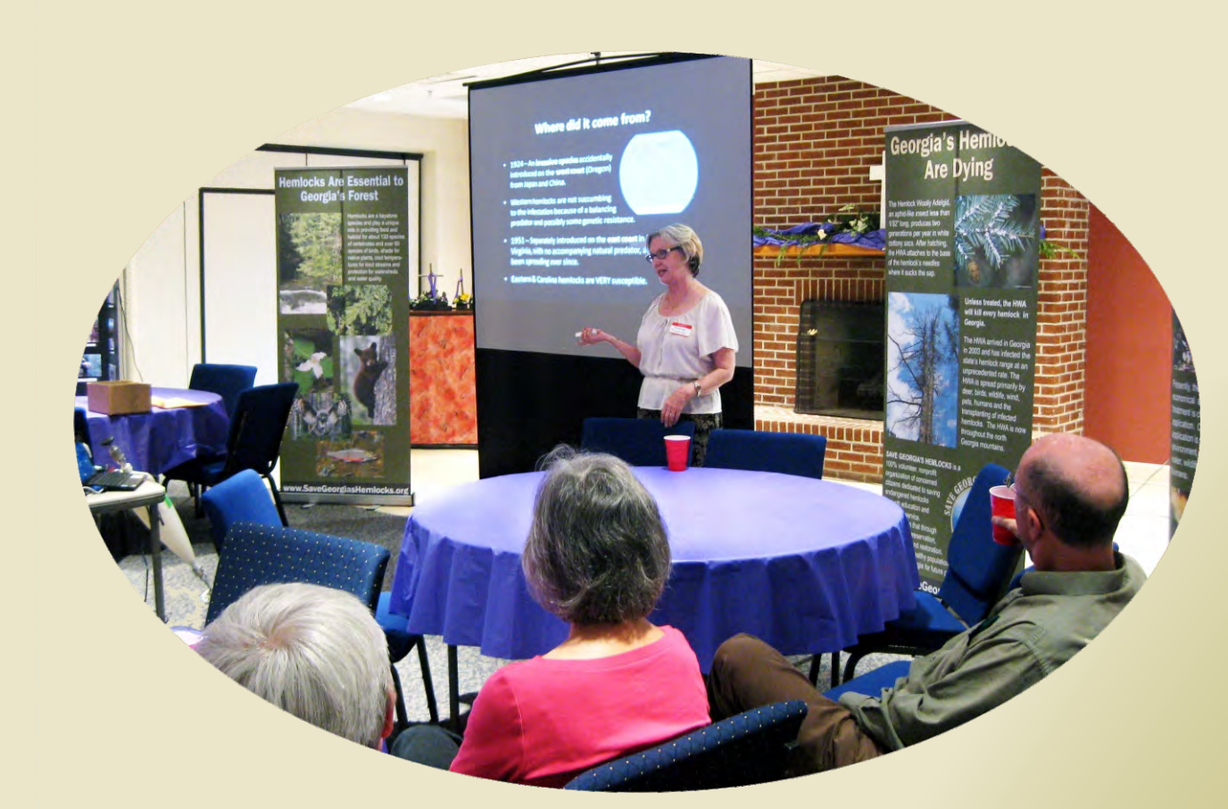
Hemlock Help Clinics and presentations to community groups to raise awareness of the hemlock problem and current solutions.