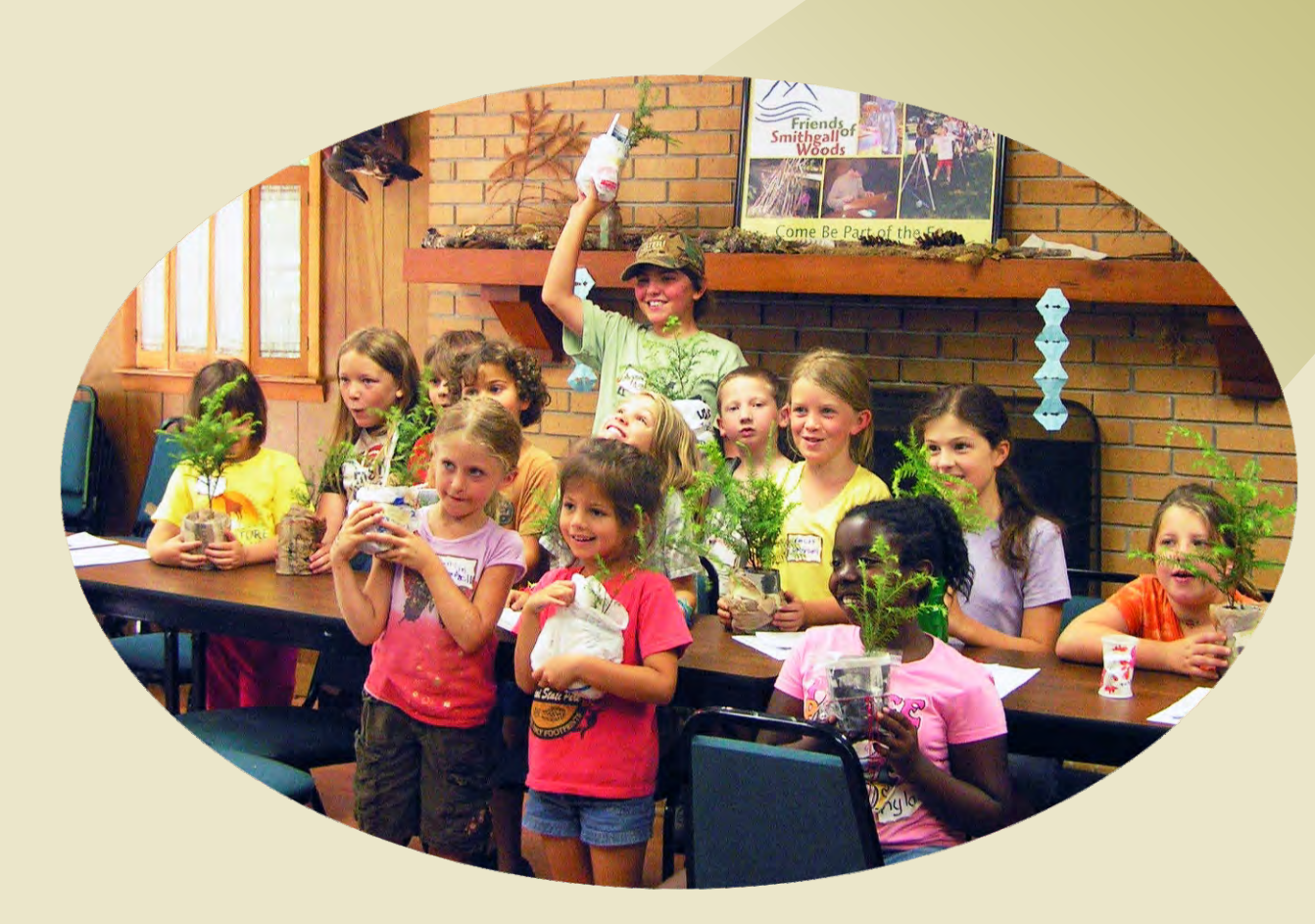
Hemlock Lessons with seedling potting for school groups and camps to engage the next generation and share the hemlock message with their families.