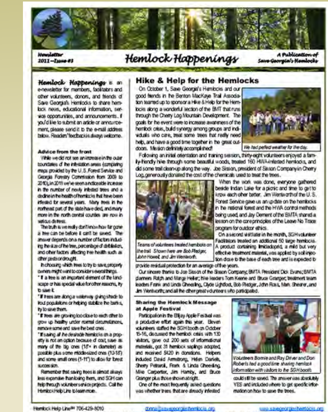
Quarterly newsletters for members, donors, and friends to share new developments, progress, tips, and upcoming or completed events.