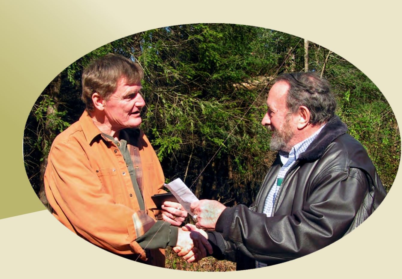
Free on-site Facilitator visits to property owners to assess HWA infestations, explain treatment options, and help property owners get started.