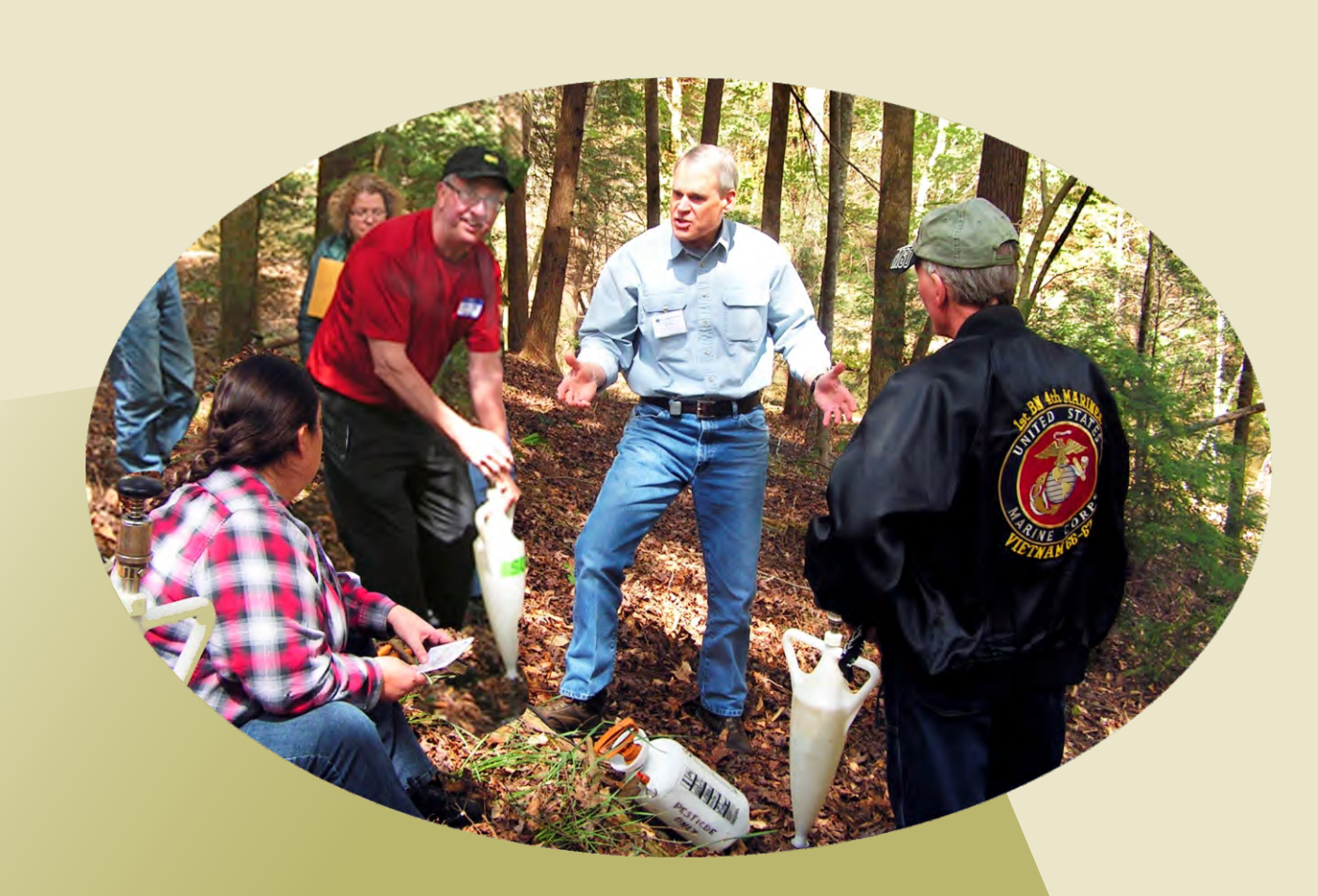
Facilitator training to prepare volunteers to advise and assist others in their community and to lead hemlock treatment projects. Facilitators have been trained in GA, TN, AL, and NC