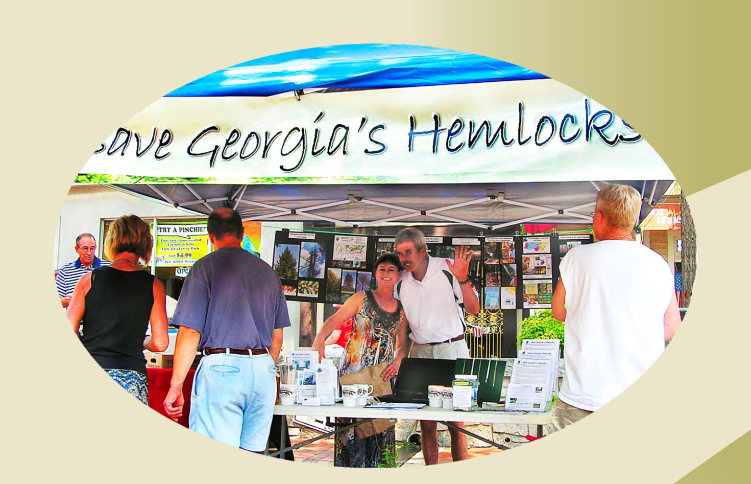
Participation in local fairs and festivals to raise awareness, provide useful printed information, and offer healthy hemlock saplings for adoption.