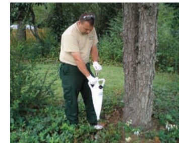
Fig. 4 - Insecticide being applied by using a soil injector to inject the chemical into the ground.

Soil Treatments: In this systemic treatment, an approved insecticide is applied to the soil around the base of the tree and is taken up by the root system. There are several products that are labeled for this type of application. This includes