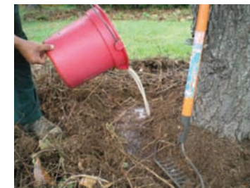
Fig. 5 - Insecticide being applied to the soil by mixing the chemical with water and pouring around the tree.

products that contain the active ingredient, imidacloprid, such as Bayer Advanced Tree & Shrub Insect Control®, Merit®, Imidipro®, Touchstone®, Zenith®, Quali-Pro®, and Lesco®. A product called Safari 20 SG®, containing the active ingredient dinotefuran, is also effective. Bayer Advanced Tree & Shrub Insect Control® can be purchased at most hardware stores and the other products can be purchased from pesticide distributors or some farm supply stores. The application is made by mixing the chemical with water and injecting or pouring it into the soil around the base of the tree (Figures 4 & 5). Soil applications are best made in the spring (March to early June) or fall (mid-September to mid-November) when adequate soil moisture is present. Avoid applications to frozen or waterlogged soil. One application can provide protection for 2-3 years. Soil injection is currently the most effective approach for treating HWA.