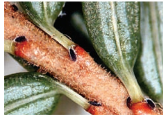
Fig. 2 - HWA nymphs in summer dormancy.

settles at the base of a needle, then inserts a long feeding tube called a stylet. The nymph will remain here until reaching maturity in late May to early June. If tree health is very poor, a portion of the spring generation will form into winged adults that fly off in search of a spruce tree. However, no suitable species of spruce is found in North America, resulting in the death of the winged adelgids. The spring generation adults that remain on the tree lay 20-75 eggs each, beginning the winter generation. Crawlers hatch from the eggs in late June to early July and disperse to settle on the newest hemlock growth. Once attached, the nymphs go dormant for the summer and no wool is produced during this time (Figure 2). In early October the nymphs break dormancy and begin to feed and produce their woolly covering. The nymphs become mature adults by mid February to mid March.