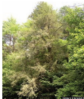
Fig. 3 - Hemlock tree in serious decline due to HWA infestation.