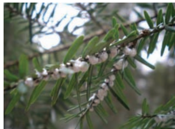
Fig. 1 - Mature HWA and ovisacs in late winter.

The hemlock woolly adelgid is a tiny insect measuring approximately 1/16th of an inch long. As the adelgid matures, it produces and covers itself and its eggs with a white, waxy filament (Figure 1). This waxy covering provides protection from predators and from drying out. The adelgid is most conspicuous from late fall to early summer when the “woolly” covering is present. Adelgids are found primarily on the underside of branches at the base of needles on the newest growth.