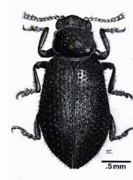
Adult emerges mid-October

Every Laricobius nigrinus beetle represents between 220 – 250 HWA eggs eaten (ave. 235) . Critical for larva to have adequate needle duff to pupate in. Larvae tunnel to the interface between needles and soil and pupate over the summer. If the hemlock does not have needle duff (rocky areas) then the summer predators dominate. We don't yet have effective summer predators yet as per our sampling. We find a very tiny amount of Sasajiscymnus tsugae on certain trees, not effective in our area.