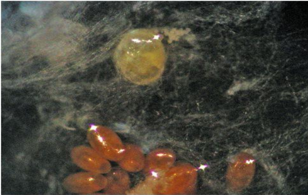
Laricobius nigrinus egg (yellow) above a cluster of HWA eggs.