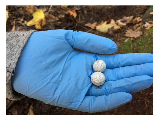
Figure 6: CoreTect slow-release imidacloprid pellet.