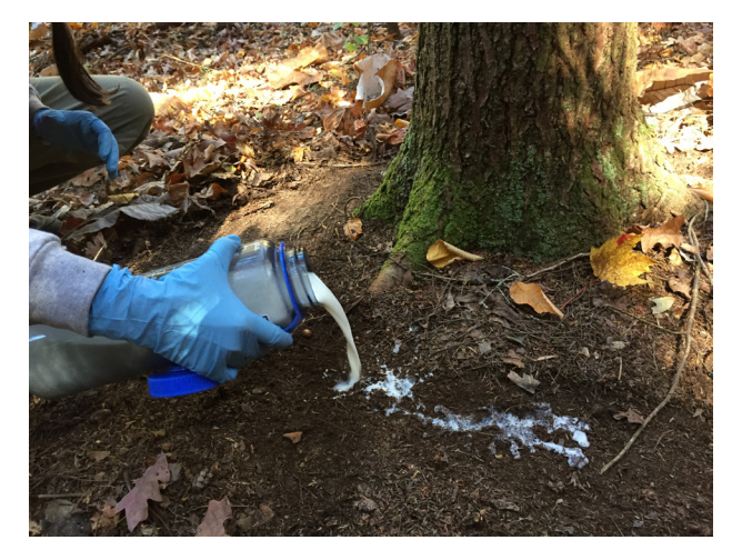
Figure 5: Soil drench insecticide application.

As with contact insecticides, care should be taken when applying systemic insecticides, including wearing personal protection equipment, being mindful of the site conditions and following label instructions. Systemic insecticide soil applications should not be made within 10 feet of a stream channel.<sup>21</sup>