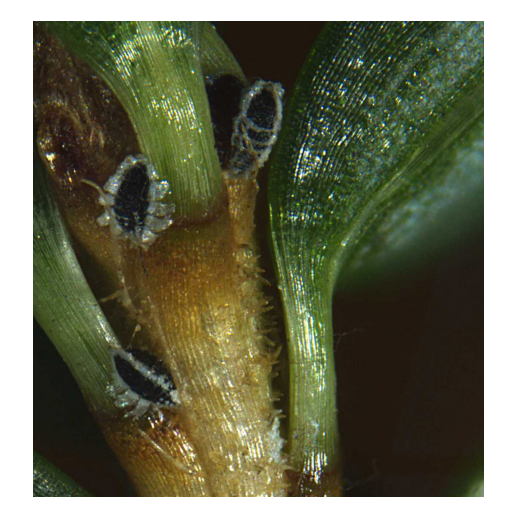
Figure 4: HWA just beginning to produce wool.

Hemlock loss results in both ecological and economic damage. Once hemlock mortality has occurred, forest ecosystems are altered from arthropod's canopy habitat all the way down to stream conditions and the associated stream fauna.<sup>2,10,11</sup> Wildlife, plant communities, and aquatic communities are all affected by the loss of this foundation species.<sup>10,11,12</sup> There are also economic costs from hemlock mortality, including reduced property values, tree removal costs, reduced tourism, impacts to the nursery industry, and increased safety issues due to dead trees in the urban and rural landscape.<sup>13,14</sup> However, effective HWA management can reduce these effects to some degree.