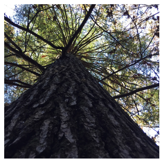
Fig. 1: View of a hemlock canopy from the forest floor.

<sup>a</sup> Tsuga canadensis (L.) Carrière (Pinaceae) <sup>b</sup> Tsuga caroliniana Engelmann (Pinaceae) <sup>c</sup> Adelges tsugae Annand (Hemiptera: Adelgidae)