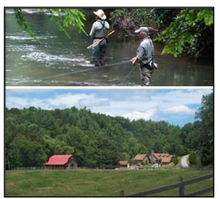
Frog Hollow

October 1 – We will hold our second annual Hemlock Camp Meeting at Frog Hollow in Dahlonega.