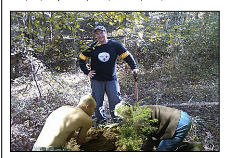
Volunteers planting saplings

Anyone who would like to request a charitable project is invited to contact any Board Member or call us. Requests are evaluated on the basis of financial need, conditions of the trees or site involved, benefits to the individual or community, ability and willingness of the requestor to contribute or participate in the project in some way, and the availability of SGH resources. All requests and projects are kept confidential.