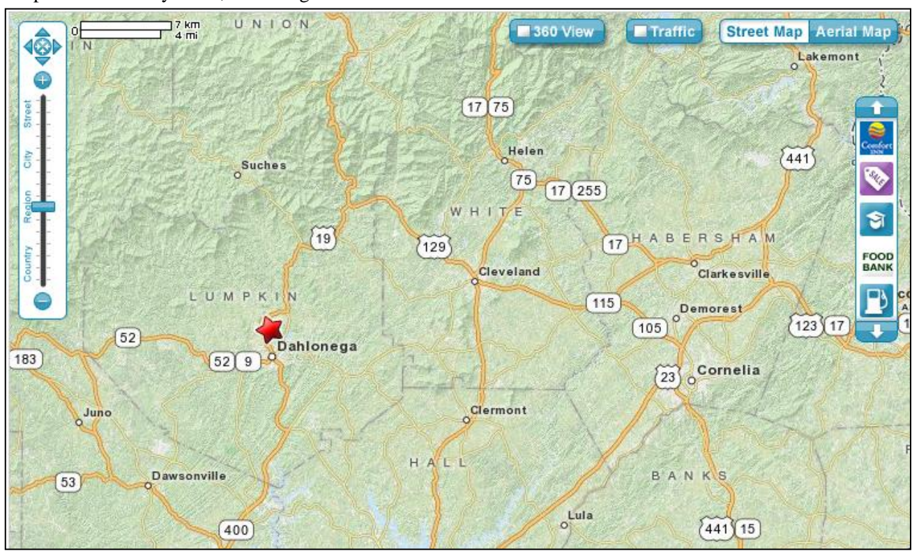
Maps for 37 Woody Bend, Dahlonega - Directions below